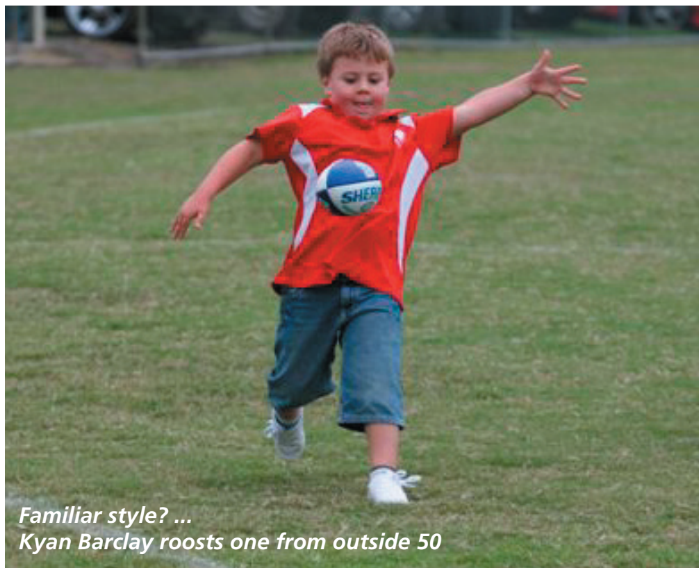
Familiar style? ...

Note: Netball reports to be included in next edition